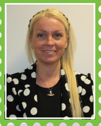
Head of Year