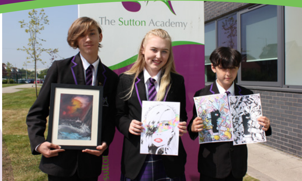
Pictured: Our successful Year 9 Dot Art students