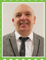
Head of Year