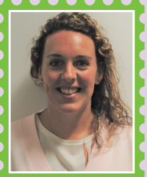
Head of Year