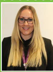
Head of Year